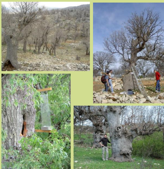
A. Pollarded oaks in Gülnar. B. Work with traps in Erdemli region. C. Window-trap in Kasnak oak forest. D. Large diameter oak in Gölhisar

Methods: In this project the same methods have been used for sampling the beetles: window traps on the tree trunk and pit fall traps in the trunk cavities. In Turkey eight stands with old hollow oaks, spread on four areas, have been studied and in UK 2 sites, France 3 sites and Sweden 4 sites. The saproxylic beetles were caught on 10 trees per stand in one season. In this preliminary presentation only 12 saproxylic beetle families are included.